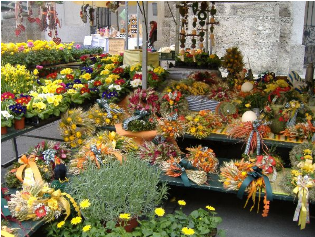
A market stall in Salzburg, with garlands on sale for Palm Sunday and Easter - taken Saturday before Palm Sunday 2007.