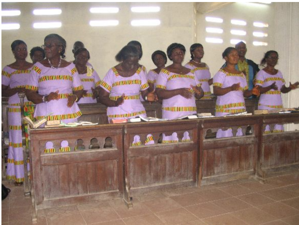
The choir of St Peter and Paul, Saltpond, Ghana