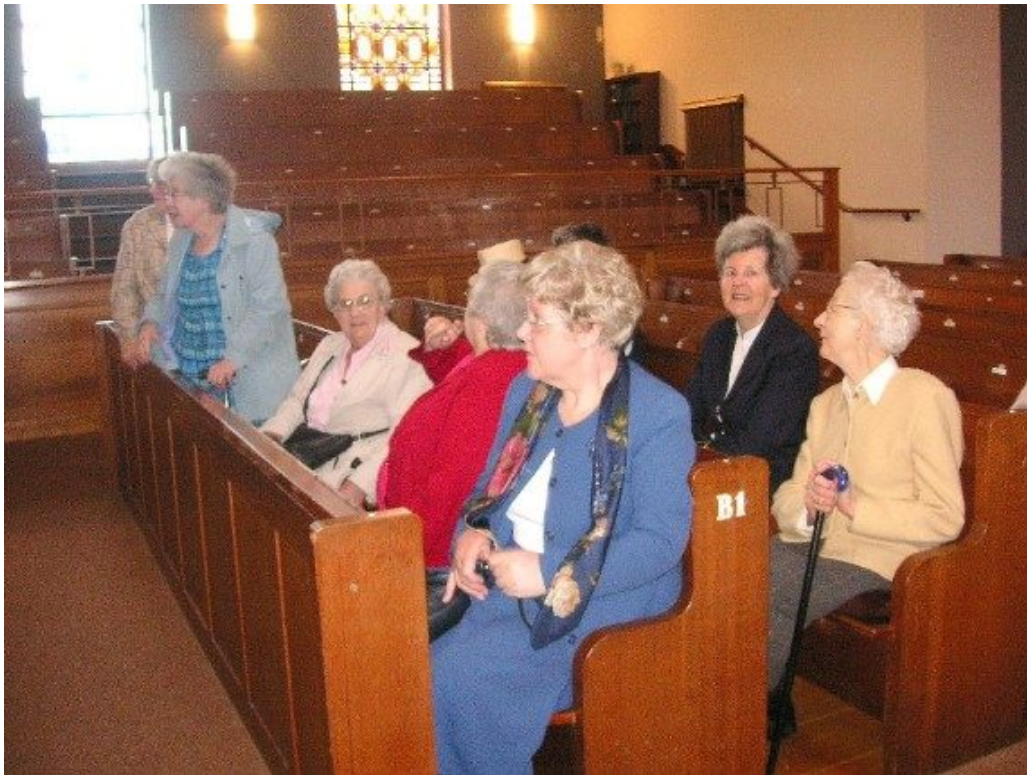
Mothers' Union members visit the Edinburgh synagogue