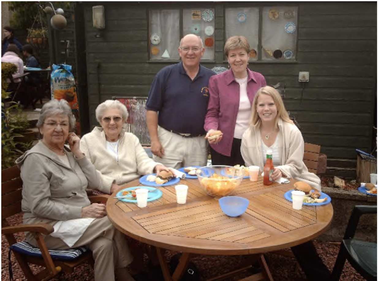
...and more Barbecue photos!